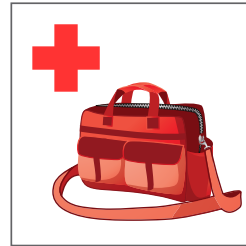
Medically Necessary and Diaper Bags*

*Infant and Medical supplies will be permitted after proper inspection.