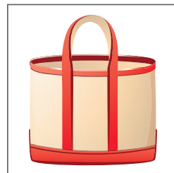
Over-sized Tote Bag