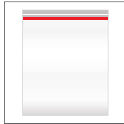
1-Gallon Plastic Freezer Bag