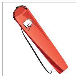
Folding Chair Bag (Folding Chair is Allowed)